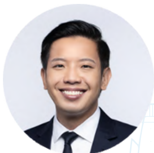
Guest of Honor Mr. Alvin Tan Minister of State Ministry of Trade and Industry Ministry of Culture, Community and Youth Republic of Singapore